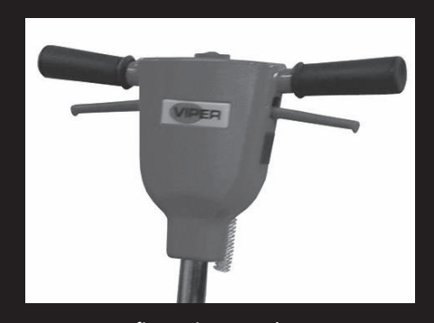
Easy-to-use, fingertip controls.