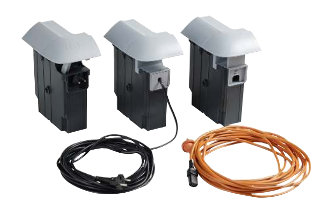
The modular VP600 allows flexibility to choose exactly what cord you need: standard, detachable or cord rewind

The modular design not only allows flexibility to choose exactly what you need but it also makes the machine easy to maintain and service for years to come. When a cord is worn out or damaged, it can easily be replaced by a new cord module in no time, providing you with a machine that need never be out of service.