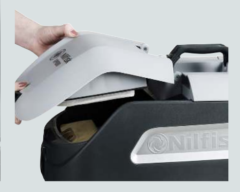
Magnetic hinges securing high reliability