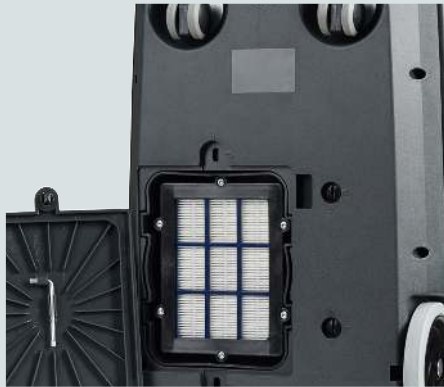
HEPA H13 exhaust filter is standard on all VP600 variants