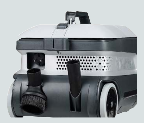
User friendly and easy to reach accessories